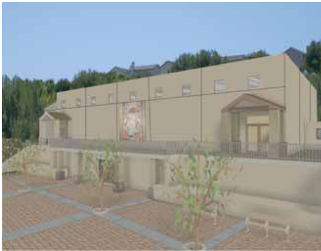
Front of New Building and Brick Courtyard Rendering

Campaign Update: Pledged: AVCS-$403,923 Received: AVCS-$140,994